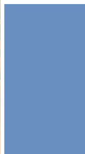
Is the Silk Road any less dangerous today for companies than it was for Marco Polo? Not really.

Outsourcing far away means dealing with different cultures, different time zones, long travelling. It is not as easy and not as cheap as it first seems.